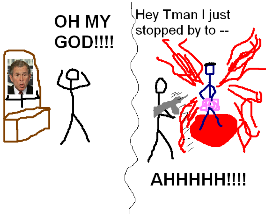
FIGURE 3. Ugly